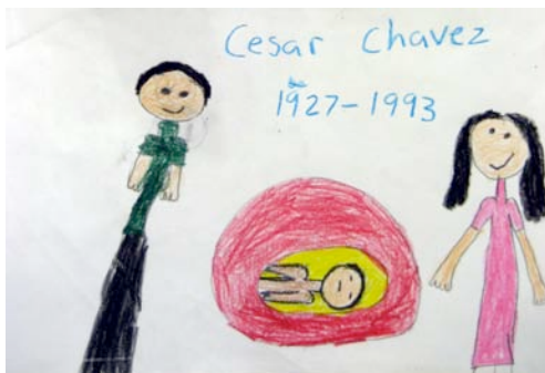
sample panels #1 and #4